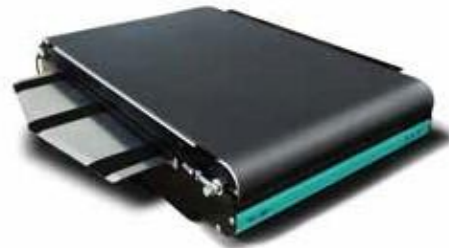
Cross belt servo motorized roller direct drive technology