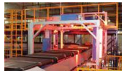
Camera barcode recognition system

Damon employs a loop cable which transmits radio waves. Thanks to the high-speed roaming technology, cart control accuracy can be ensured no matter how long the sorter loop is. The control system utilizes Profinet, TCP / IP and RS485 for communications. To achieve high performance PRODAVE and OPC communication technology is used.