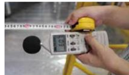
High speed, low noise